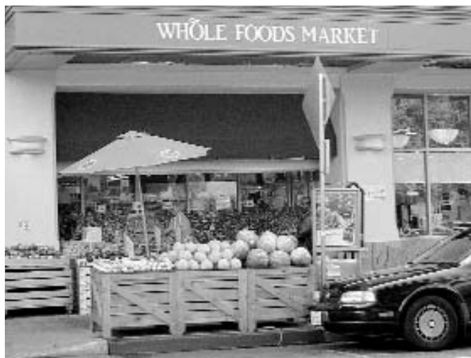
The Noyes Foundation invests in companies like Whole Foods, the world’s largest retailer of natural and organic foods, along with other firms that are committed to the environment.

Most of the program-related investments are in the form of low-interest loans to nonprofits. To take just one recent example, in 2000, Heron approved a five-year, $250,000 loan to the Greyston Foundation, a system of nonprofit and for-profit organizations in Yonkers, N.Y., that offers a wide array of programs and services for individuals seeking self-sufficiency. Greyston Bakery, the sole supplier of fudge brownies for Ben & Jerry’s ice