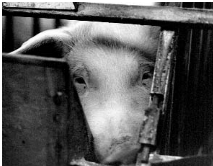
The Cummings Foundation requested a shareholder resolution on the Smithfield Foods proxy ballot, asking the hog processing giant to assess the environmental impact of its operations.

In effect, the foundation has a “firewall” between fund management and grantmaking – a clear separation that is consistent with the way most foundations operate. Historically, foundations have maintained this impermeable wall between investing and programming – the idea being that what’s business is business, and what’s social is social, and never the twain shall meet.