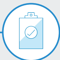
Planning and Initial Investment