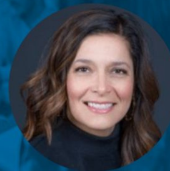
Renee Ferrufino Women's Foundation of Colorado